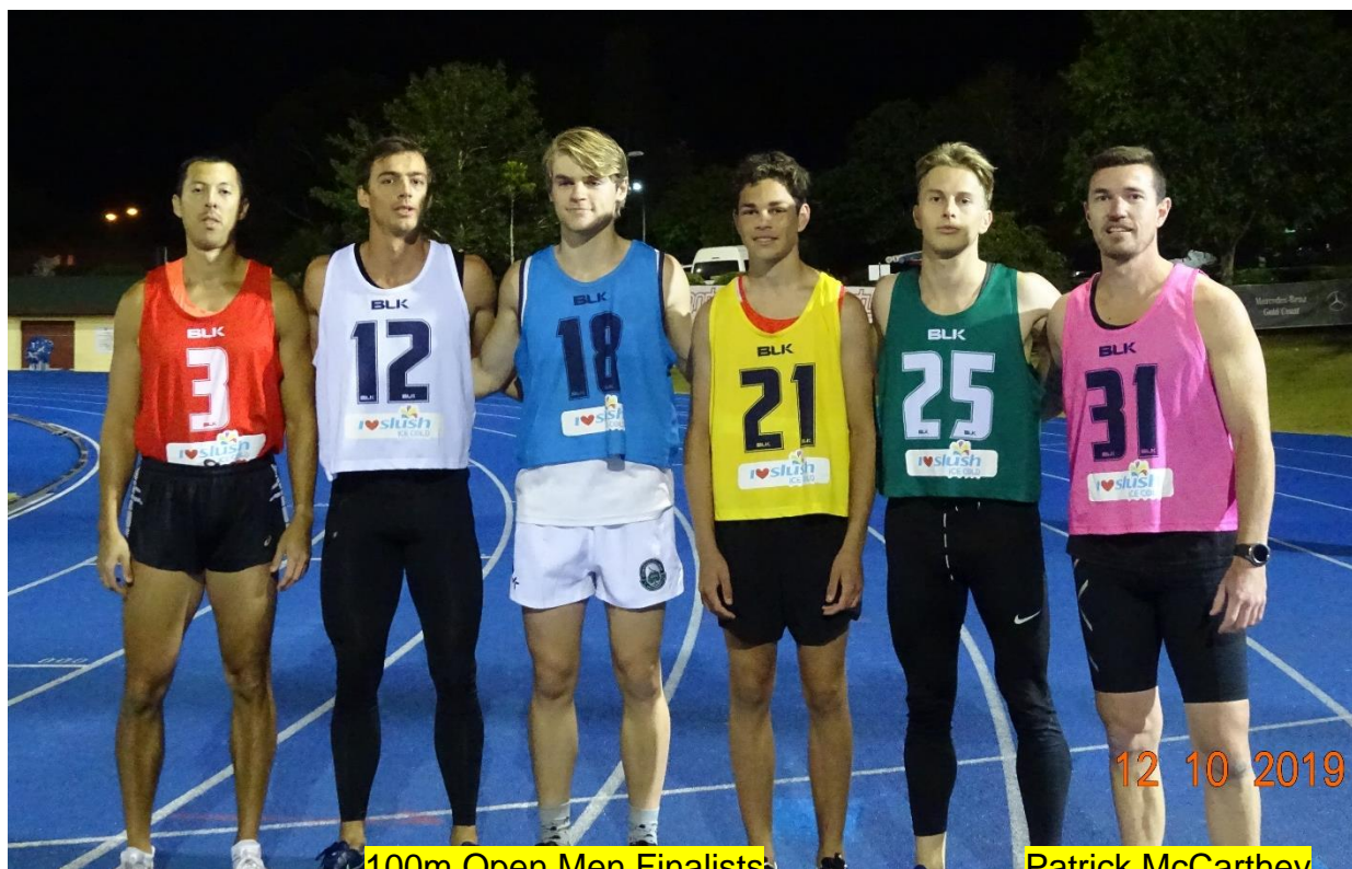
100m Open Men Finalists