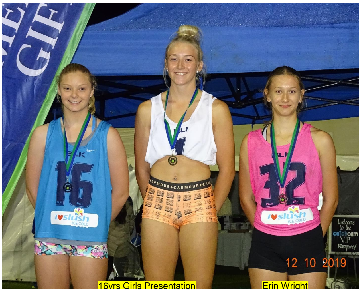
16yrs Girls Presentation