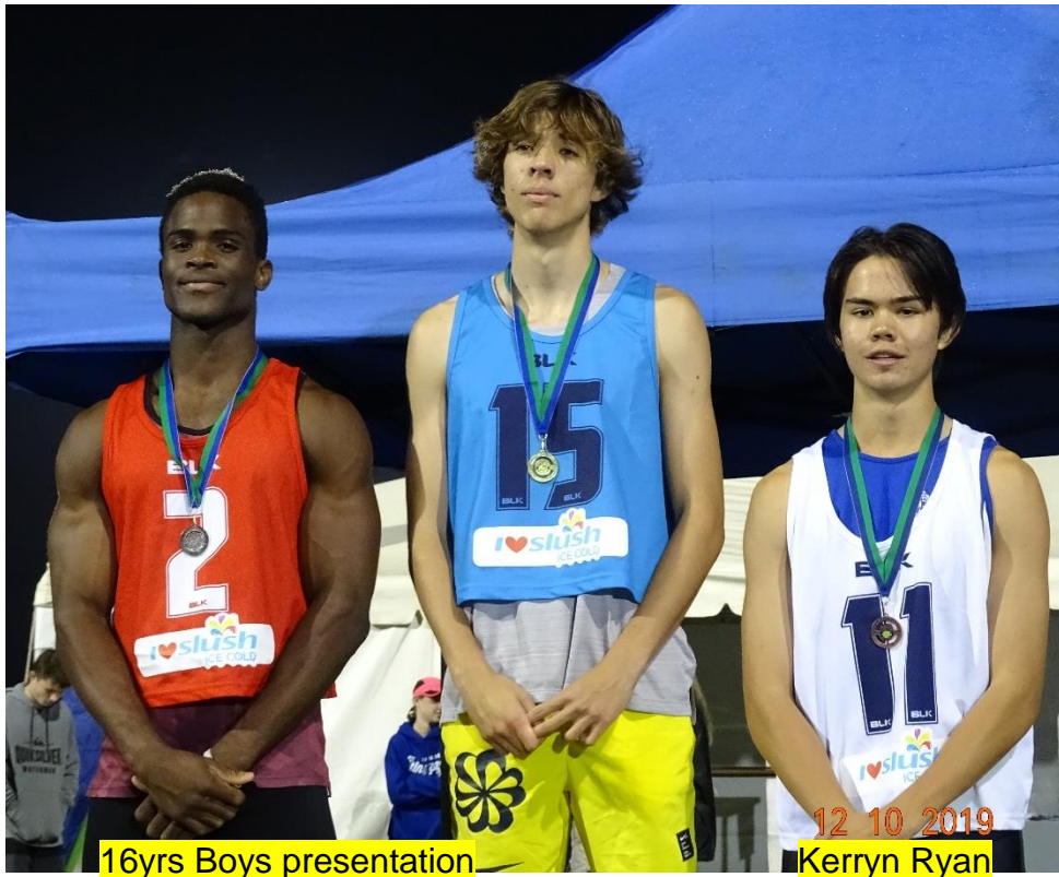
16yrs Boys presentation