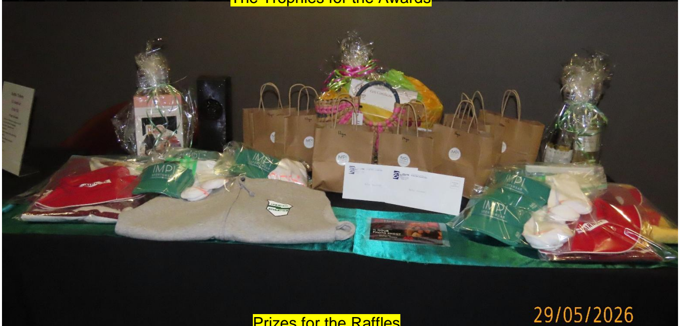
Prizes for the Raffles