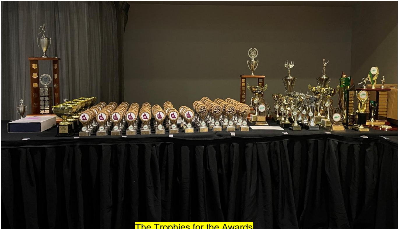
The Trophies for the Awards