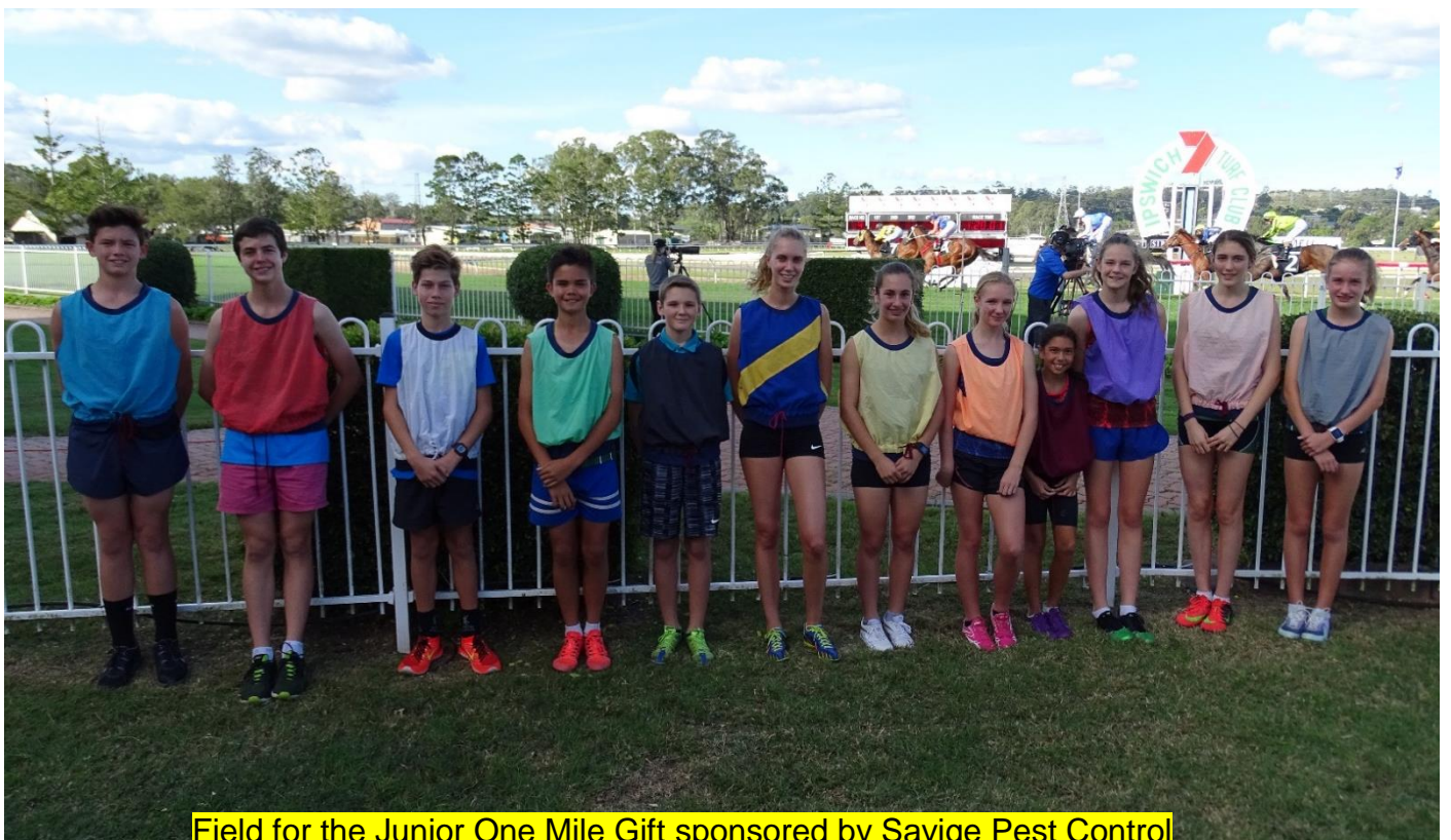
Field for the Junior One Mile Gift sponsored by Savige Pest Control