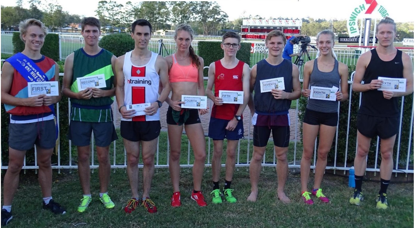
One Mile Gift placegetters sponsored by St Andrews Ipswich Private Hospital