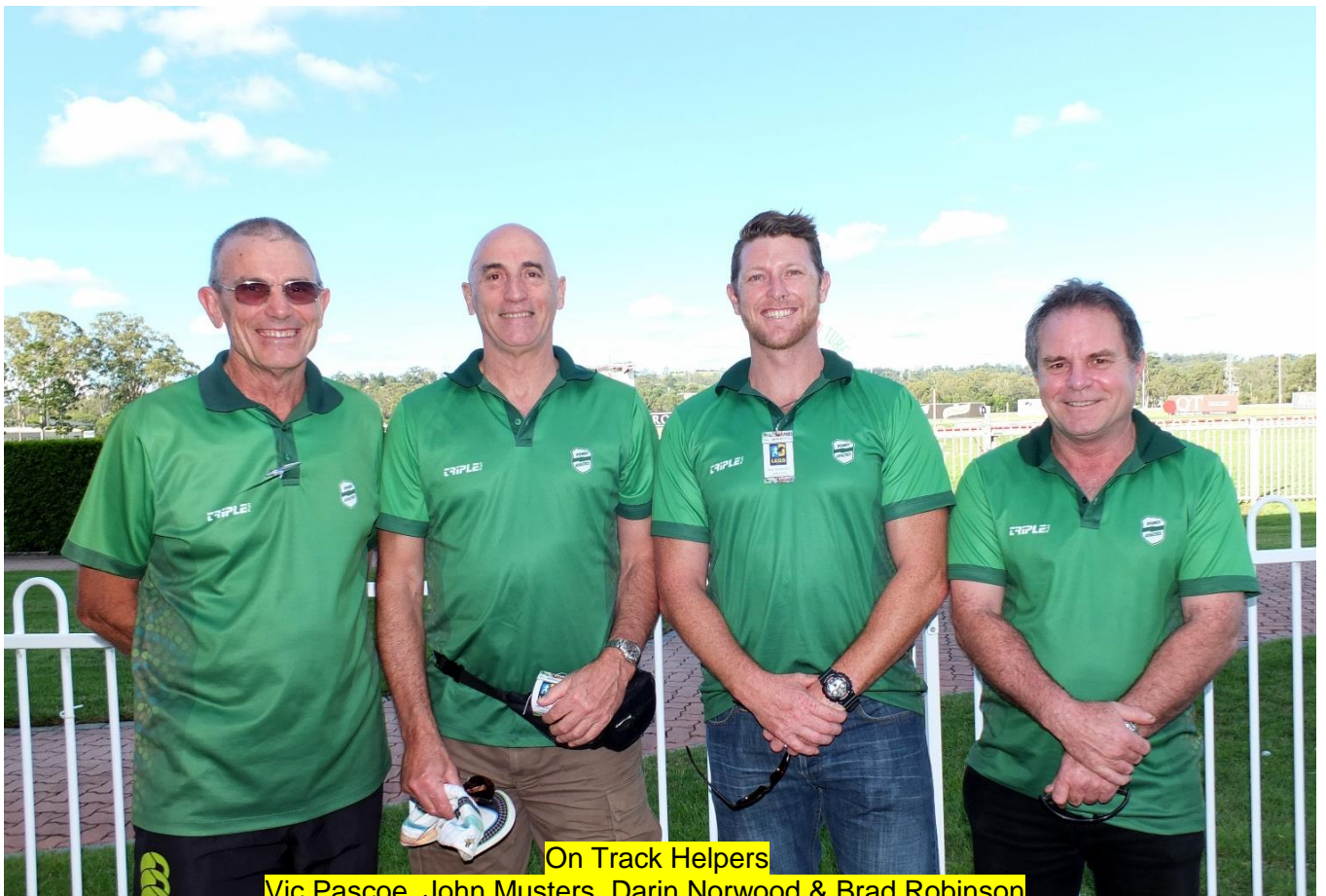
On Track Helpers