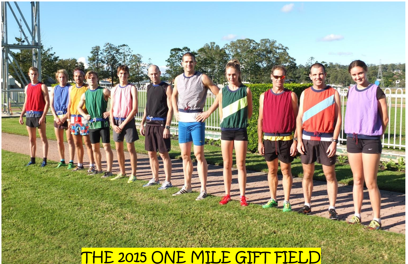
THE 2015 ONE MILE GIFT FIELD