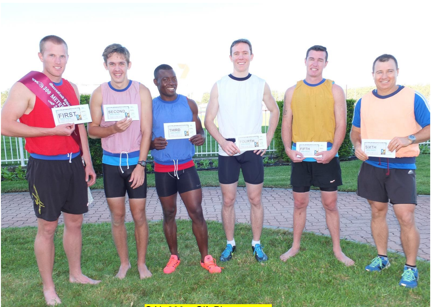
QAL 300m Gift Place getters