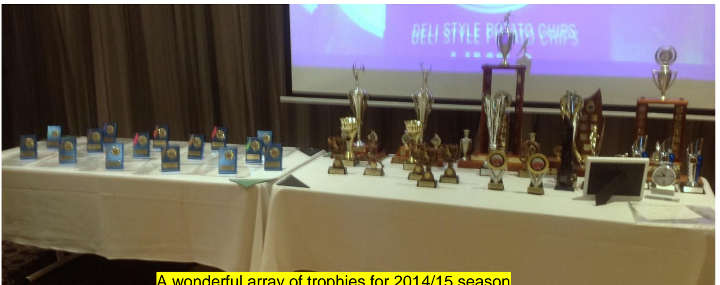
A wonderful array of trophies for 2014/15 season