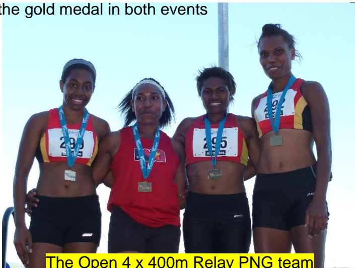
The Open 4 x 400m Relay PNG team

Miriam then performed extremely well in the open women 4 x 100m and 4 x 400m relays to gain the gold medal in both events