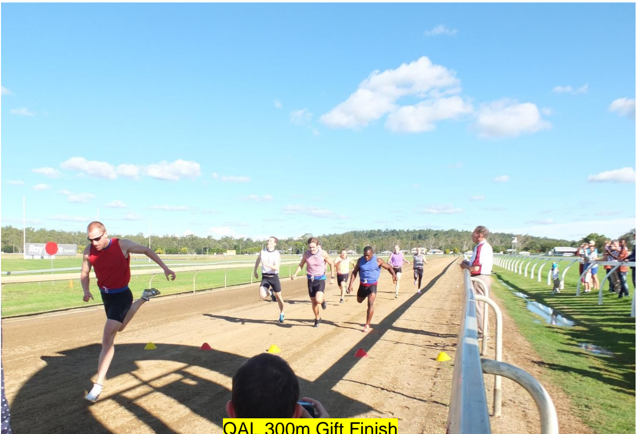
QAL 300m Gift Finish