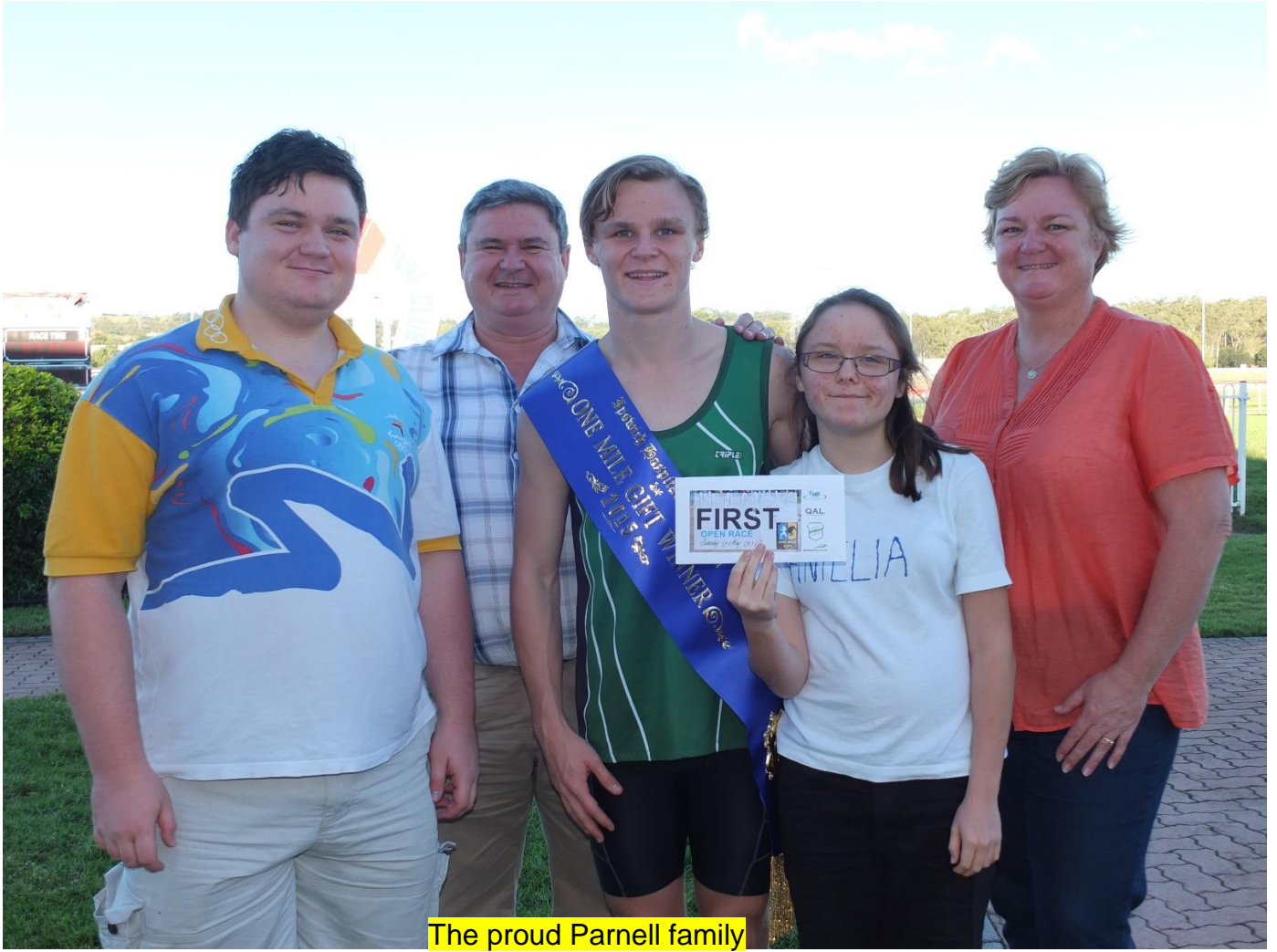
The proud Parnell family