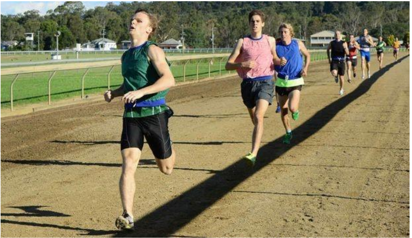
One Mile Gift near finish