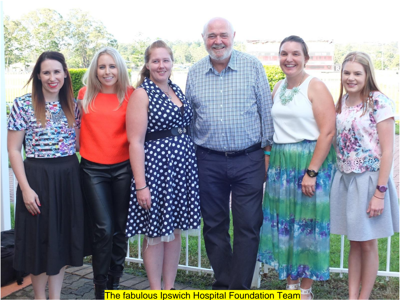
The fabulous Ipswich Hospital Foundation Team