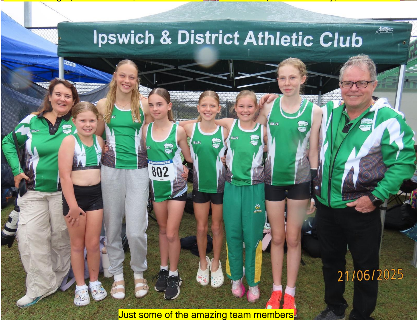
Just some of the amazing team members