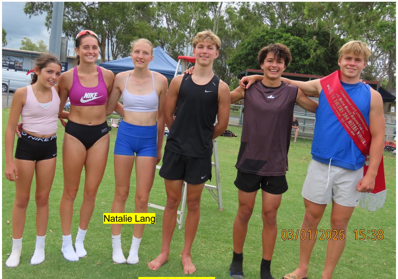
300m Gift Finalists

The Kilcoy Gift was run on Australia Day 2026 at the Kilcoy racecourse.