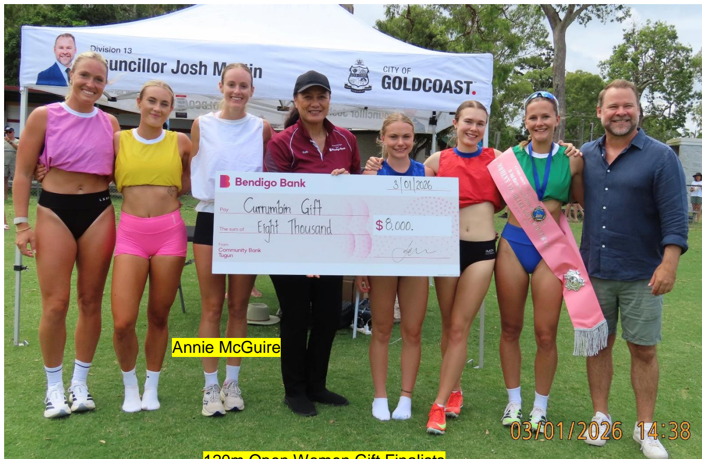
120m Open Women Gift Finalists