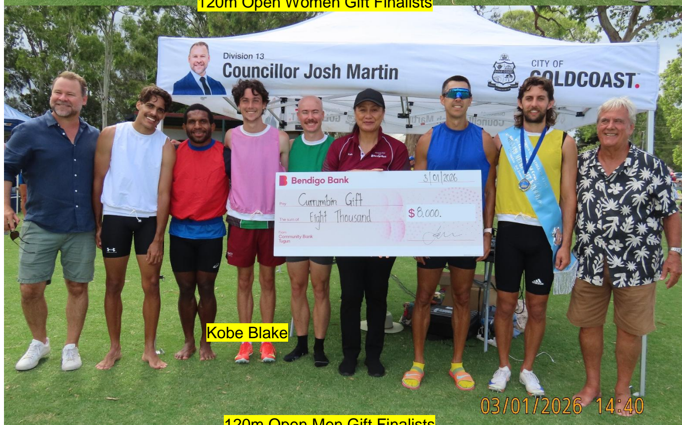
120m Open Men Gift Finalists