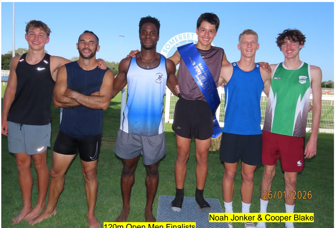
120m Open Men Finalists

Club members did well winning some money from the many gifts that was on offer.