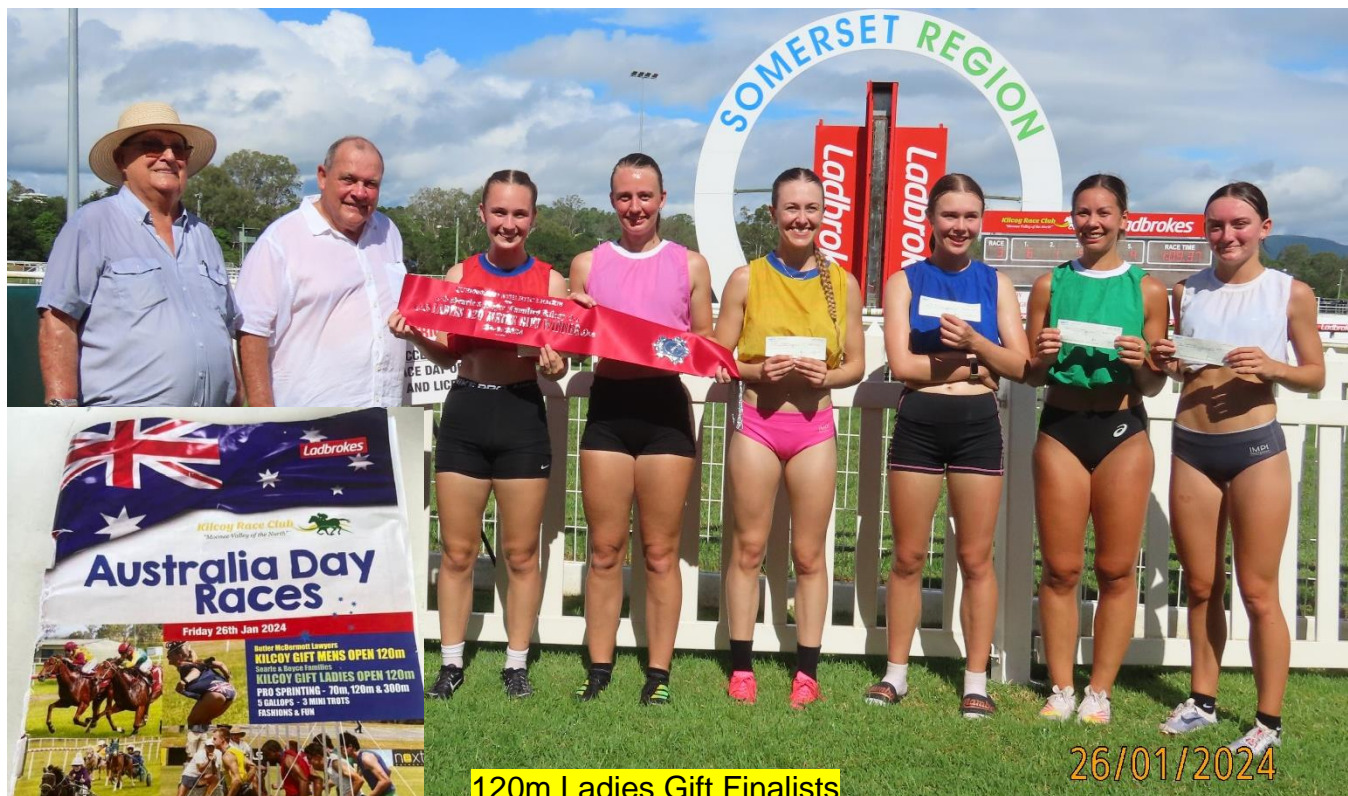
120m Ladies Gift Finalists