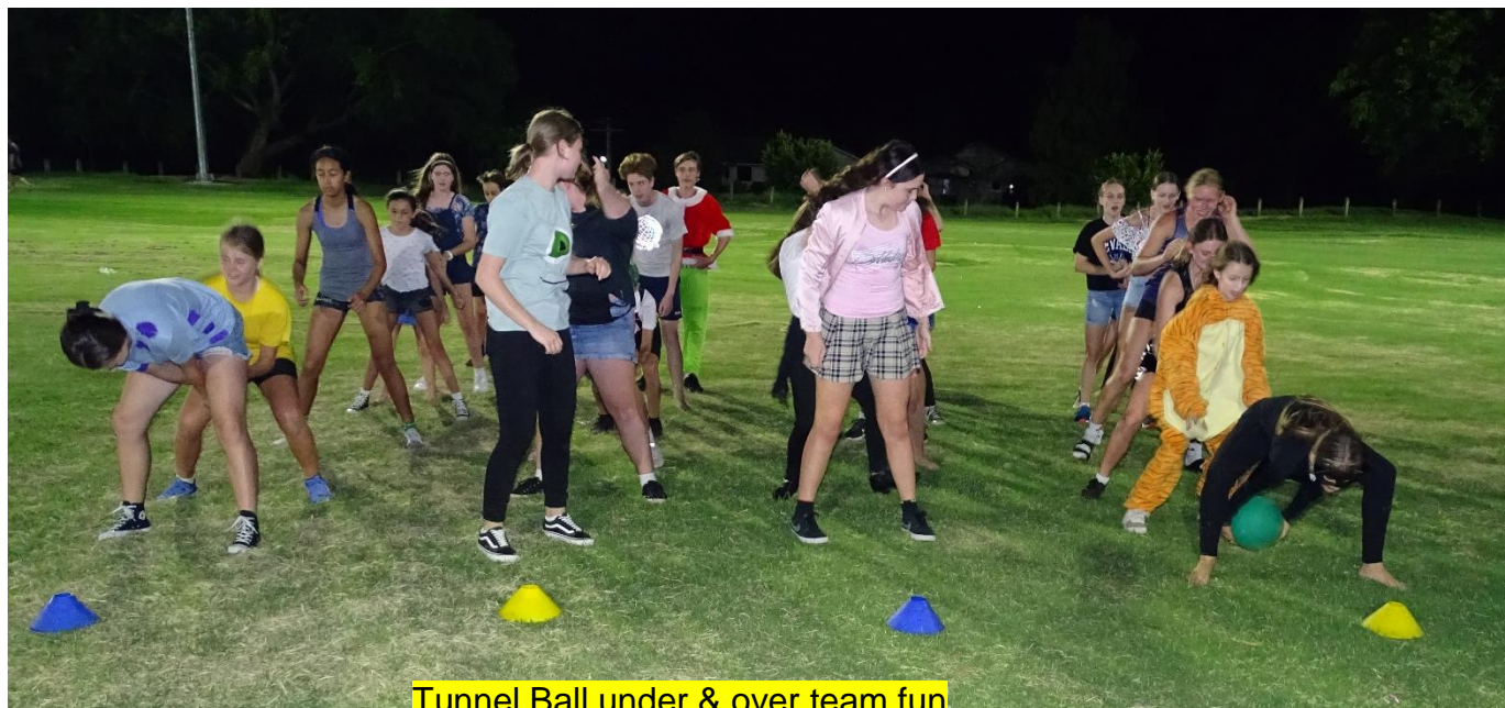
Tunnel Ball under & over team fun

We thank Rebel Sport for providing the prizes tonight's breakup.