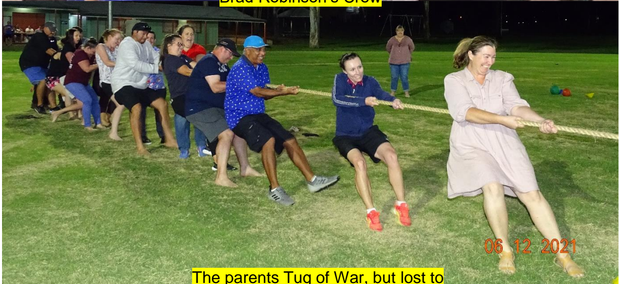
The parents Tug of War, but lost to