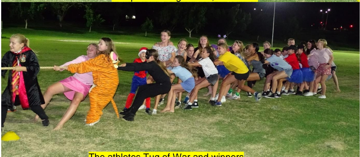
The athletes Tug of War and winners