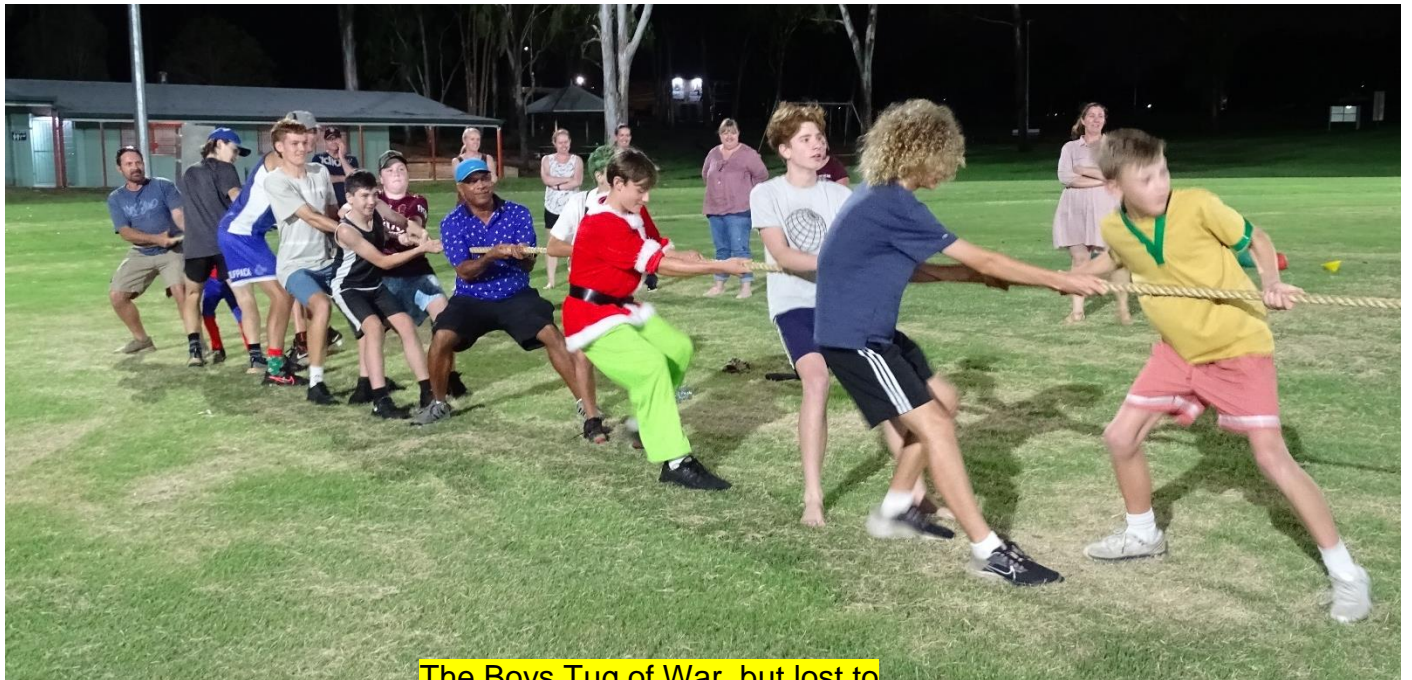
The Boys Tug of War, but lost to