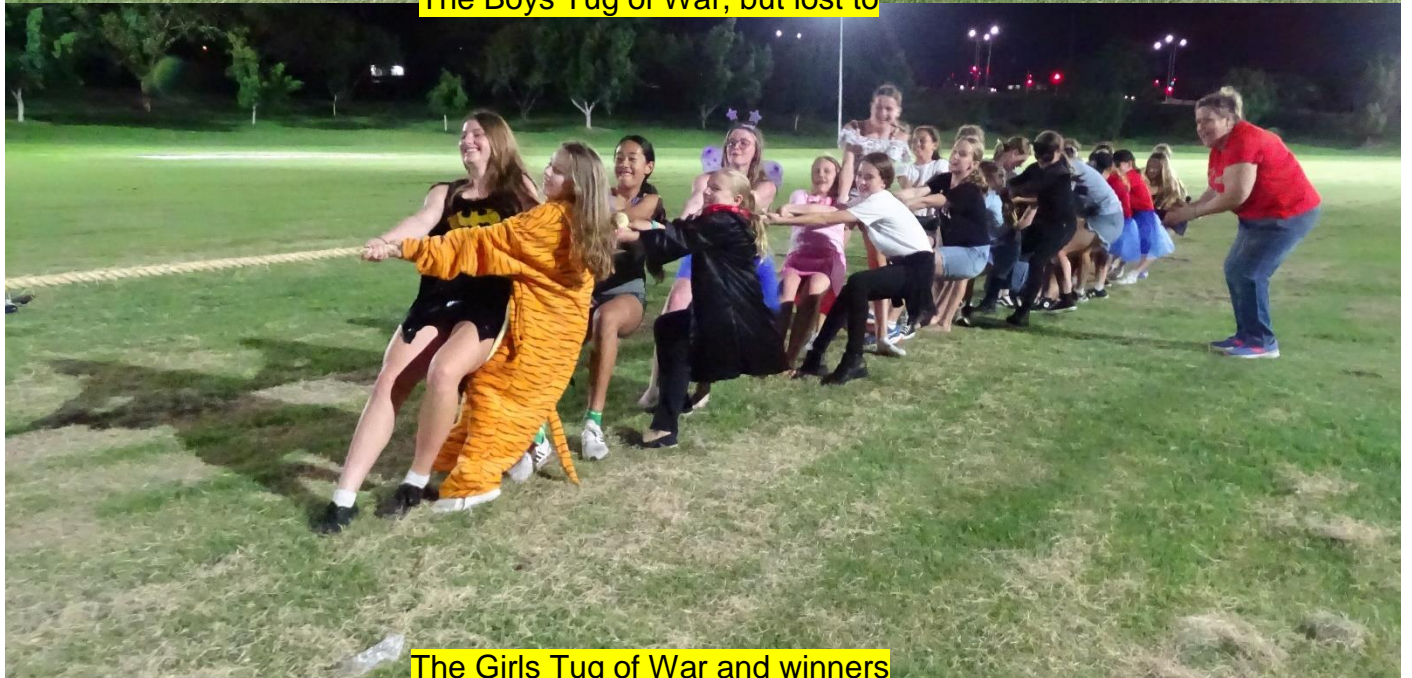
The Girls Tug of War and winners