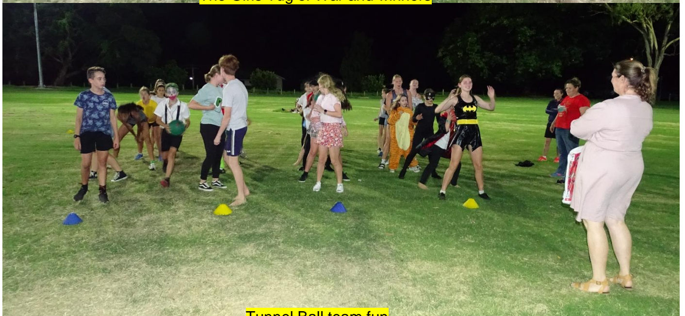
Tunnel Ball team fun