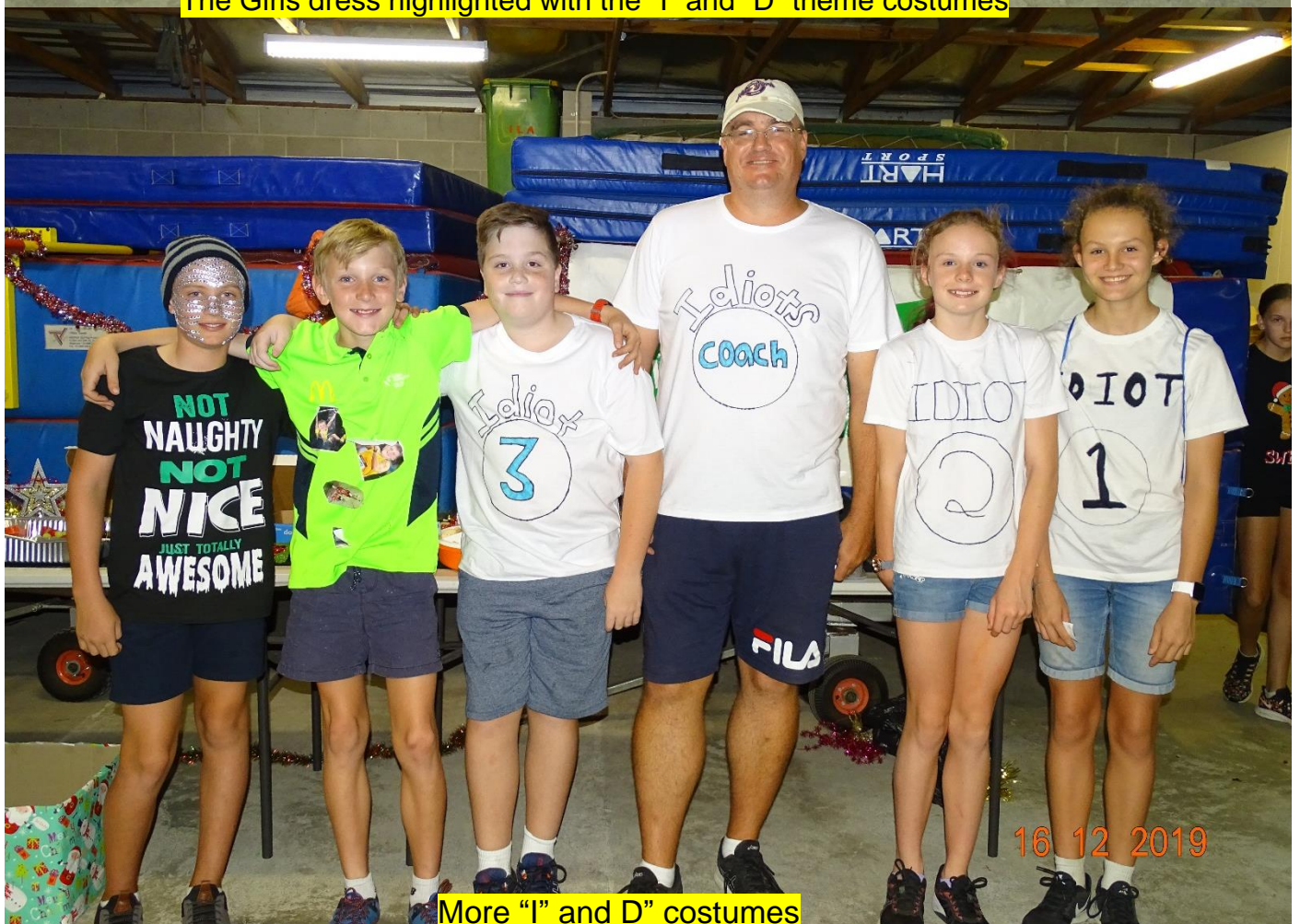
More "I" and D" costumes