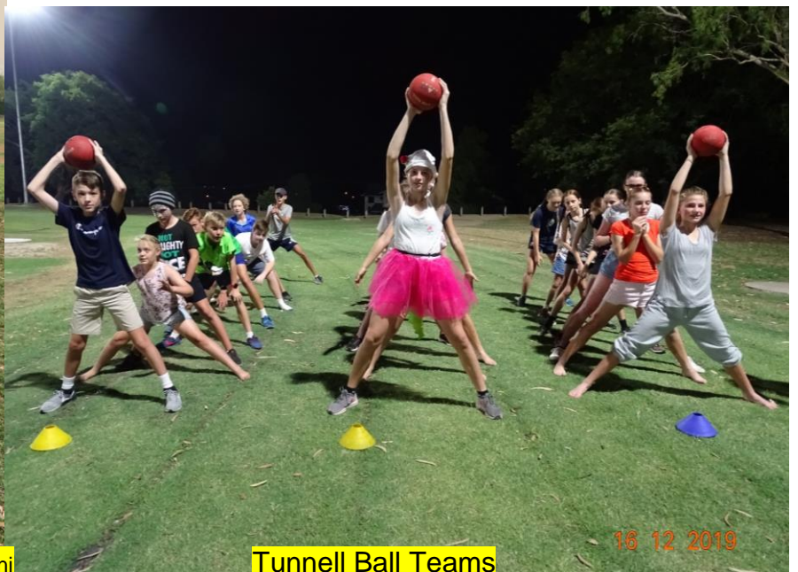
Tunnell Ball Teams