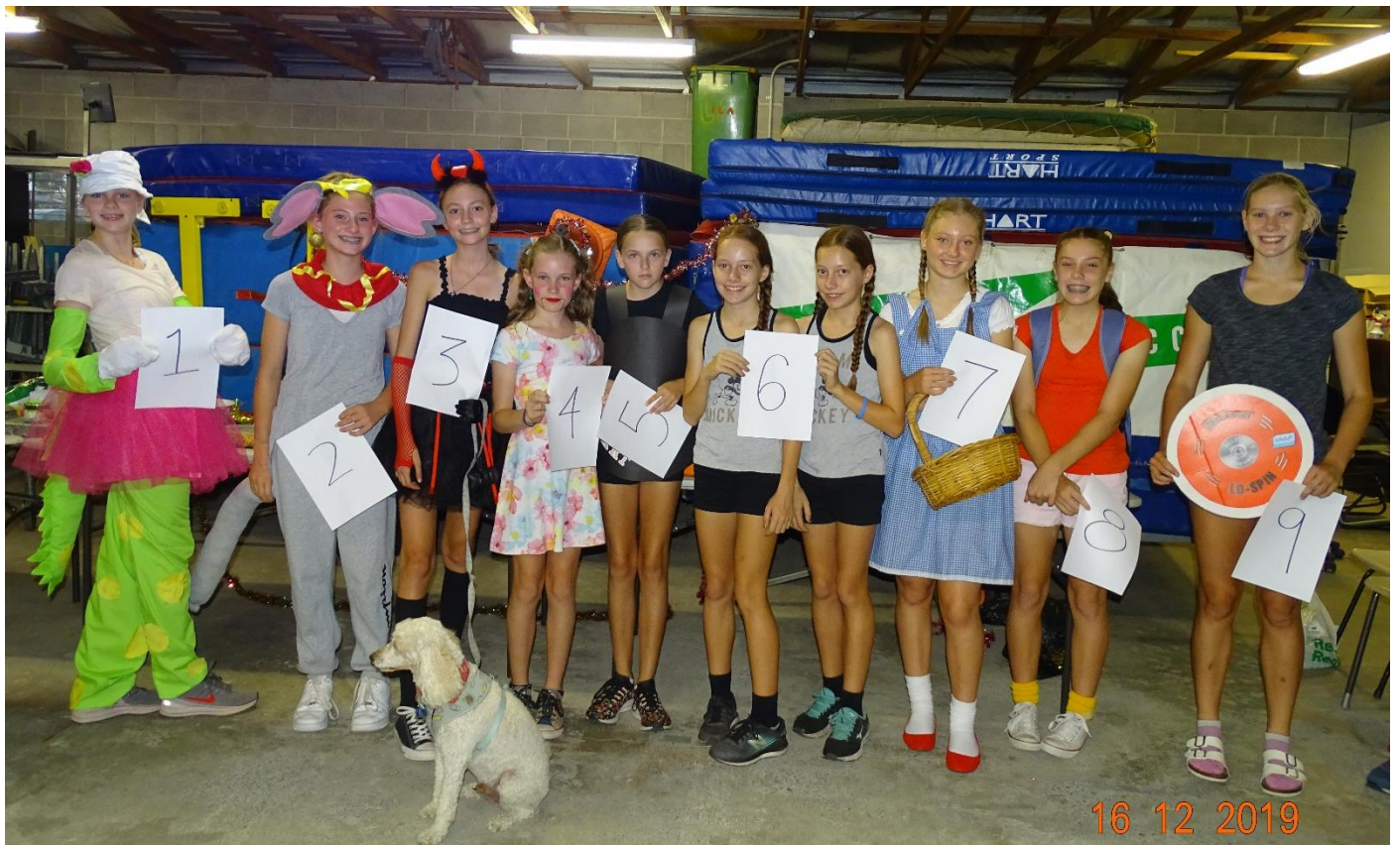
The Girls dress highlighted with the "I" and "D" theme costumes