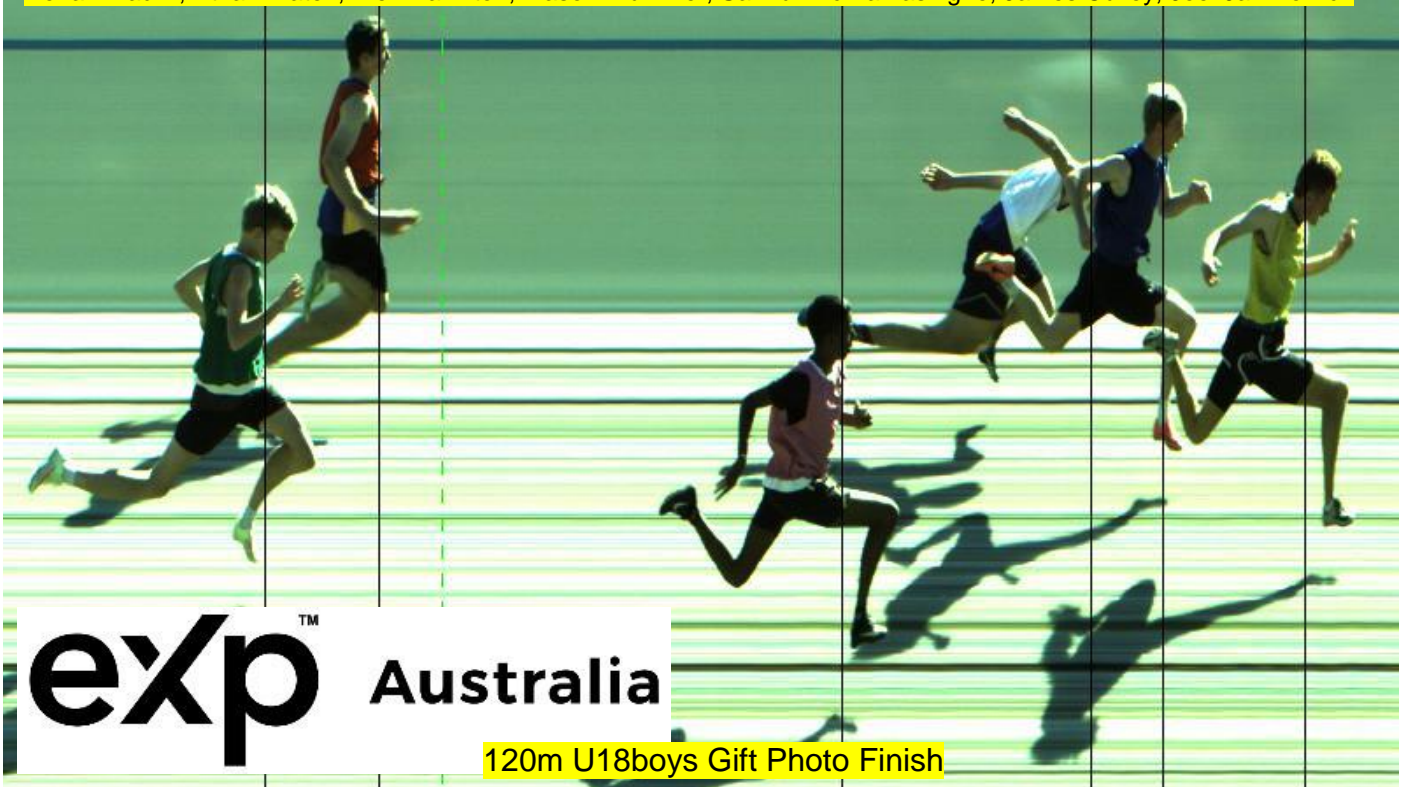
120m U18boys Gift Photo Finish