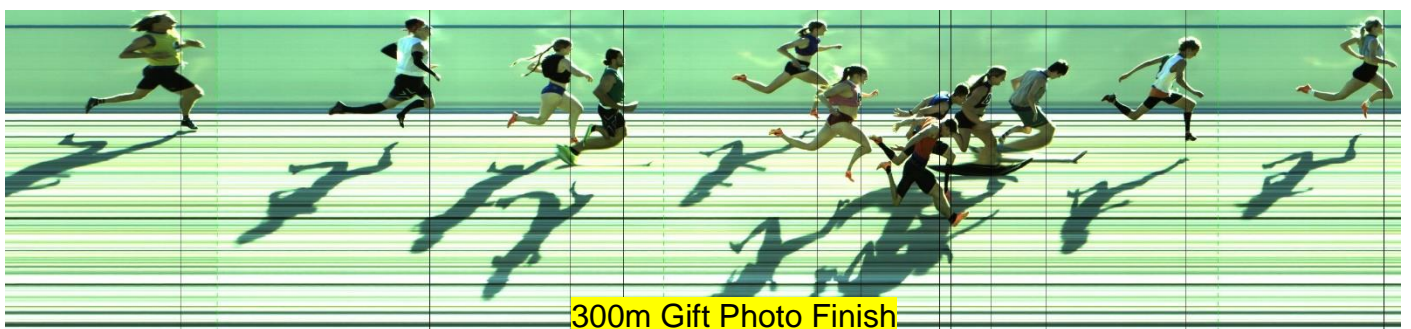
300m Gift Photo Finish