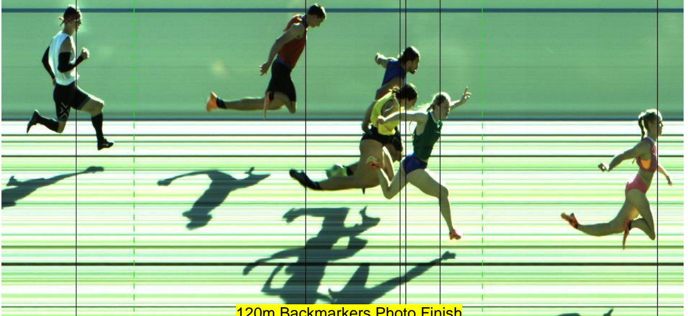
120m Backmarkers Photo Finish