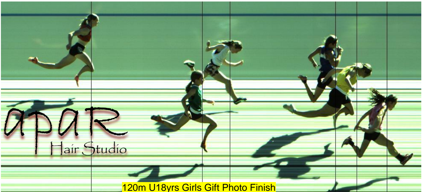
120m U18yrs Girls Gift Photo Finish