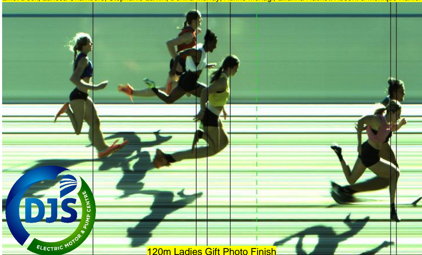
120m Ladies Gift Photo Finish