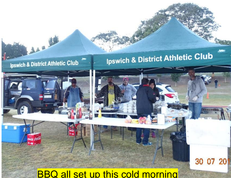
BBQ all set up this cold morning