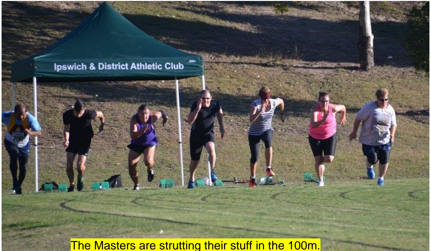
The Masters are strutting their stuff in the 100m.

Other Winter Carnival events produced 19 new records. This justifies the efforts of athletes to utilize this Carnival as a stepping stone to future endeavours. The results can be viewed at our website www.ipswichathletics.org.au .