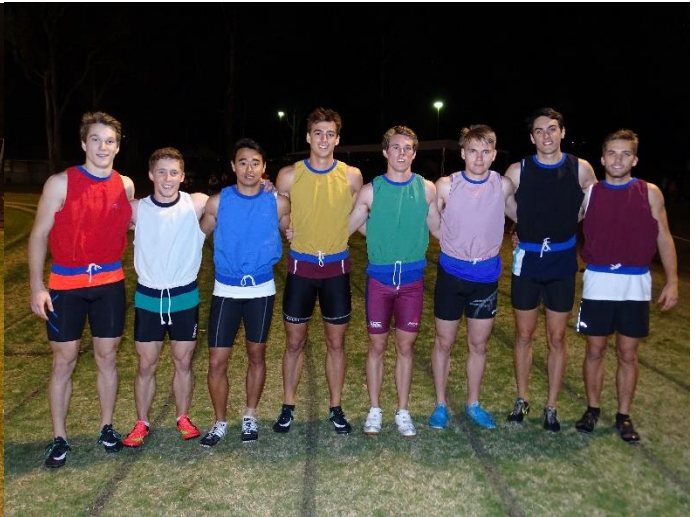
120m Lightning Gift Finalists