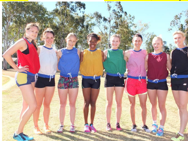
The 100m Ladies Finalists