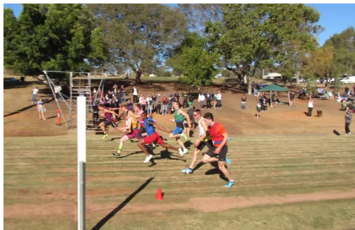
The 120m Lightning Gift finish